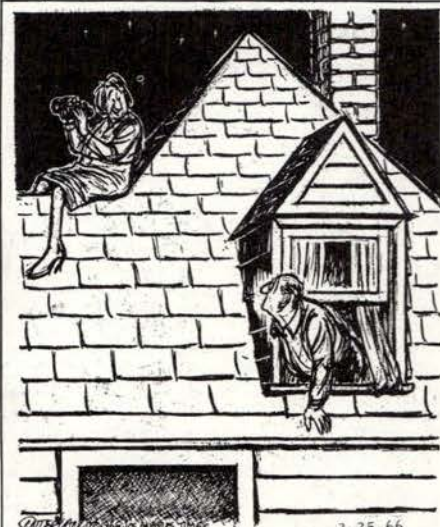
"It's flying-saucer-sighting time and I'm determined to see one!"