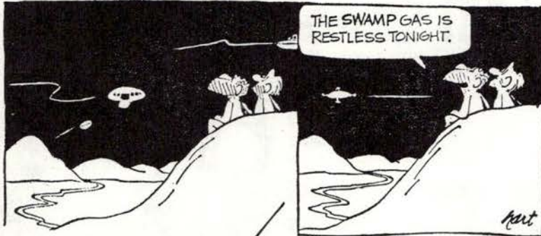
From B. C., the Post, May 9, 1966

"This is one of the primary reasons why the extra-terrestrials started making visitations in 1947, shortly after we developed this ability to watch over us and if possible to impart their advanced scientific, technological and sociological knowledge to help us re-