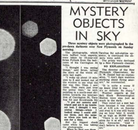
These mystery objects were photographed in the pre-dawn darkness over New Plymouth on Sunday