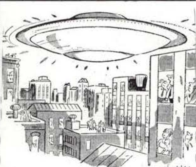
Let's see the Air Force hush this one up!

THE CHRISTIAN SCIENCE MONITOR Monday, May 2, 1966