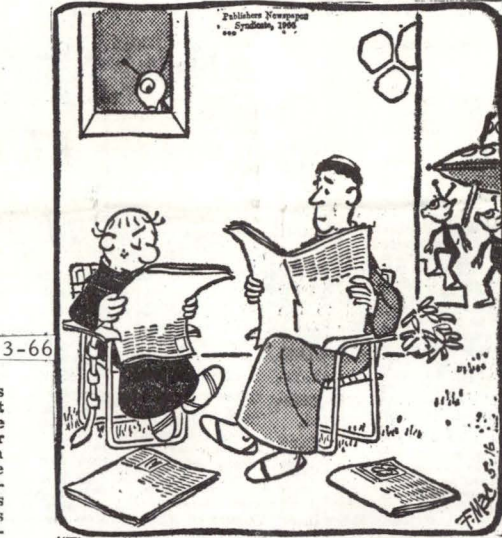
"These flying saucer stories are getting more ridiculous every day."